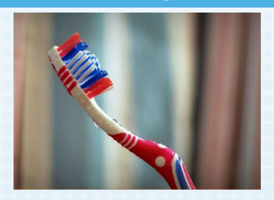
Photo courtesy of meddygarnet (@flickr.com) - granted under creative commons licence - attribution