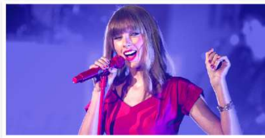
Taylor Swift is a pop and country music singer

Country music came from the southern United States. It often tells a story accompanied by string instruments, such as banjos, guitars and violins.